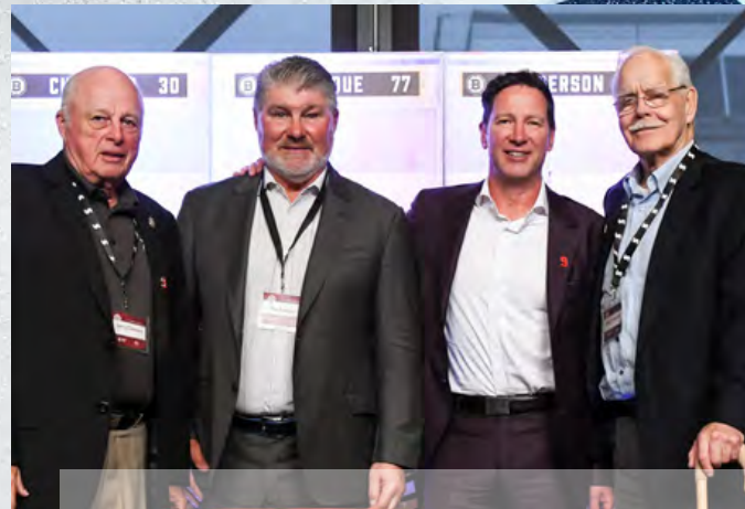
100 years of Bruins Hockey set the stage for three great names in the franchise to hit the GHC Hot Stove.