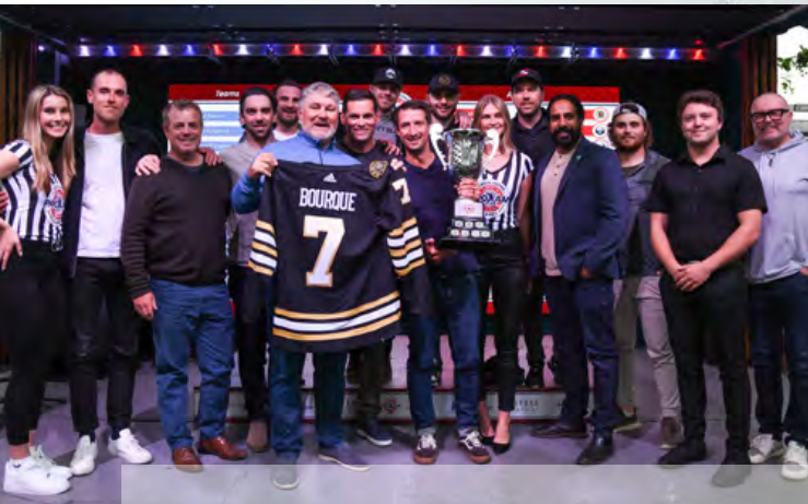
Teams kick-off the weekend with their newest NHL Alumni team addition at the Pro-Am Draft Night!