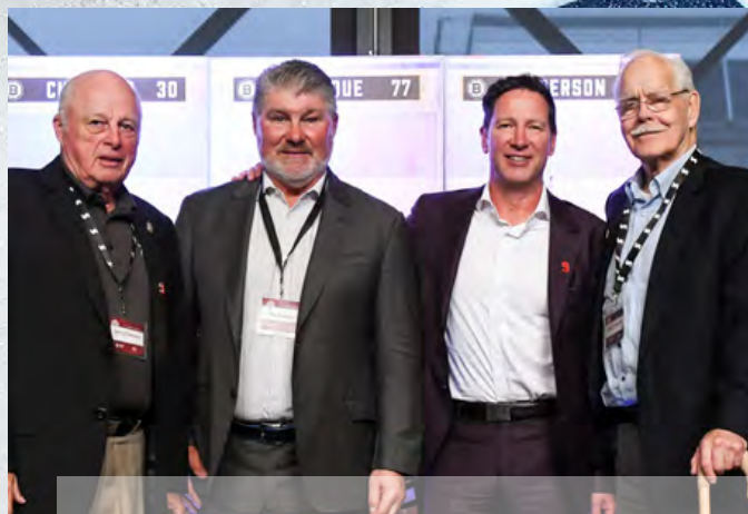
100 years of Bruins Hockey set the stage for three great names in the franchise to hit the GHC Hot Stove.