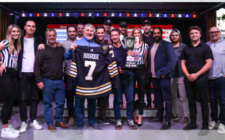
Teams kick-off the weekend with their newest NHL Alumni team addition at the Pro-Am Draft Night!

Later that evening, the Pro-Am Draft Night will take place at The Rooftop on 4th. The draft order is determined by the team's fundraising totals. The more your team raises, the higher your team will draft their favourite NHL Alumni!